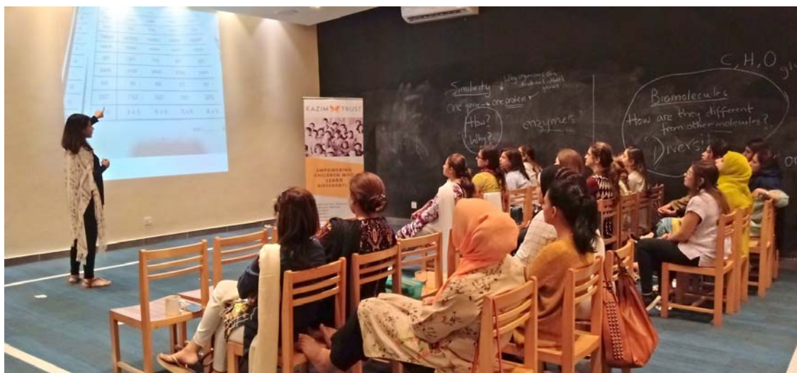
Workshop at Bayview for teachers

The workshop was conducted with almost 20 teachers. The teachers learnt about how the symptoms look like in daily school activities. They responded positively towards the workshop and discussed many students whom they felt might be suffering from such difficulties.