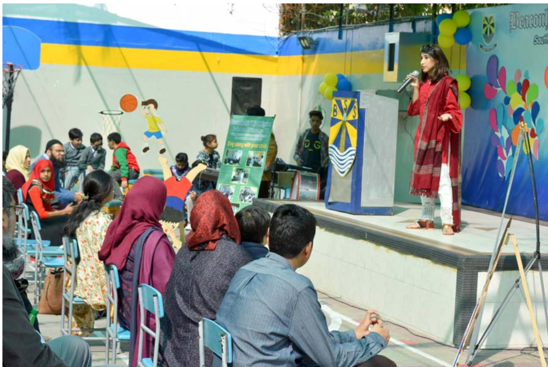
Session at Beaconhouse School for parents and teachers