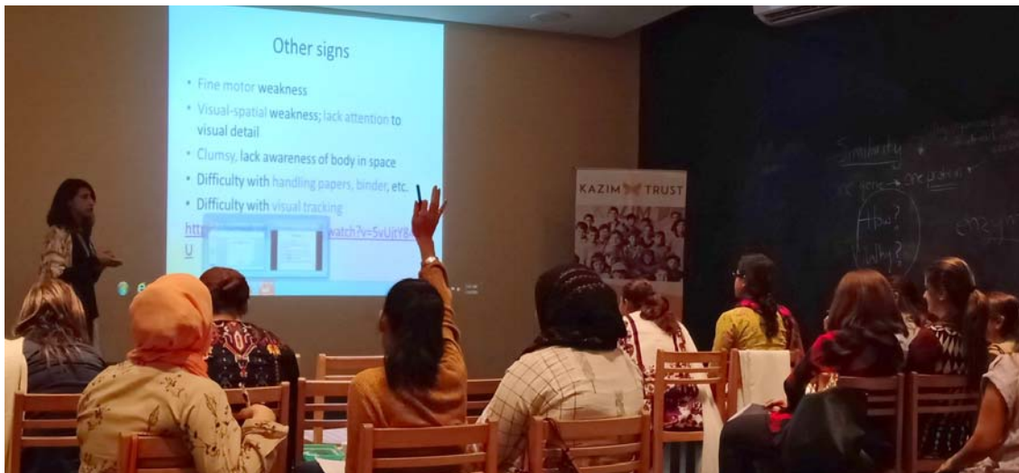
Interactive session with teachers about LD