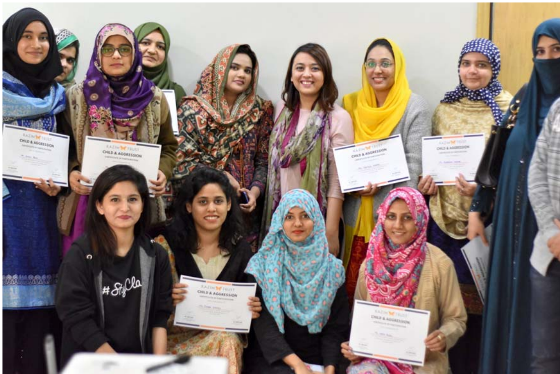
Certificate Distribution Ceremony

This workshop focused on strategies to understand what goes behind this behavior that has been displayed and how we can manage it.